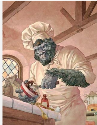
Monkey Butlers, Fact or Fiction?

By depth charge and concerted depth bomb attack the international authorities hope to rid the water of the majority of these fierce creatures. Story told by contenders in the recent London-Melbourne air race inspired this declaration of war. Above is a picture of one of the British aircraft carriers which will take part in the "war" while at the top is a map showing the infested area in the middle of the 1,500-mile flight to air from Australia, which the planes have to accomplish non-stop. The lower picture shows one of the new speedy airliners which is in use on the Singapore-Australia route of the Empire Airway extension.