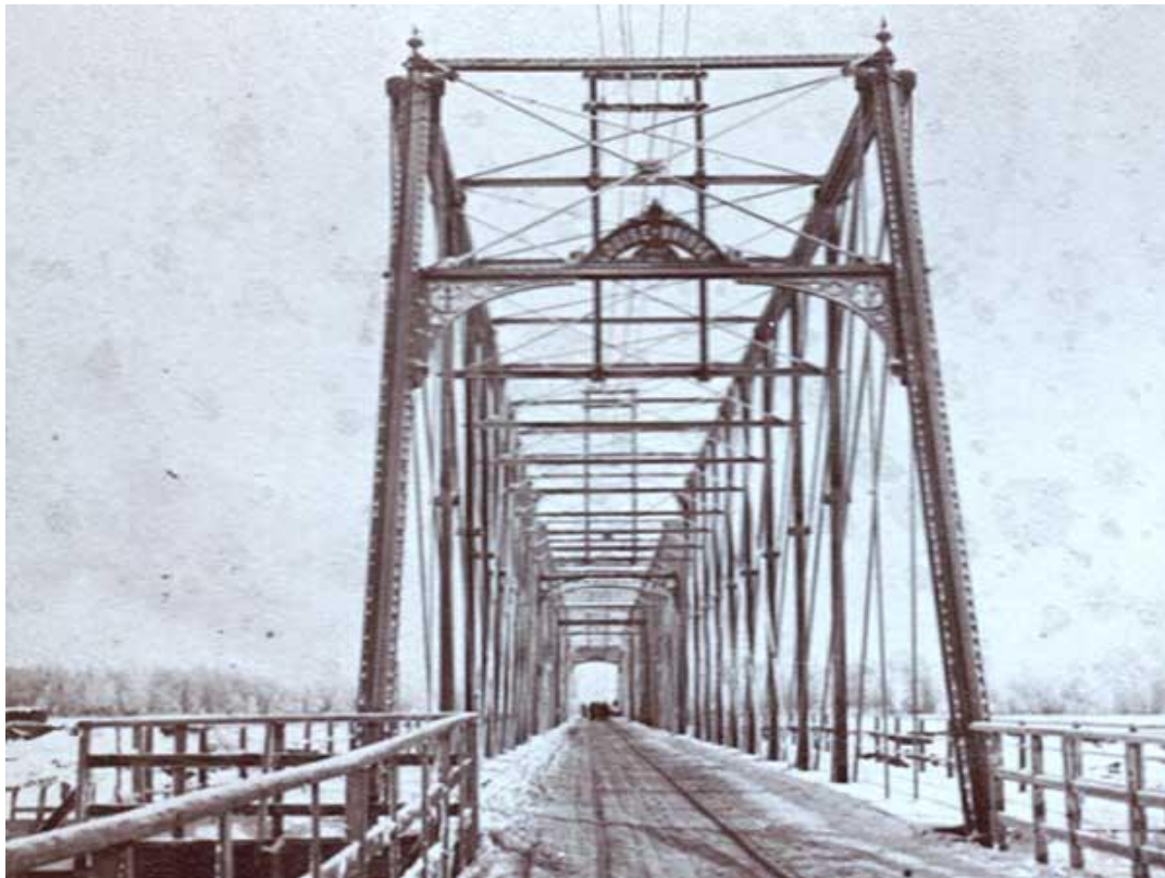
Figure A Louise Bridge early 1880s