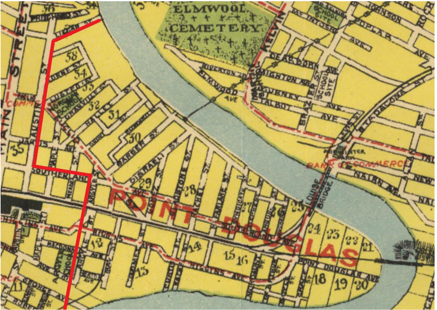
Figure F Wondertown

Wondertown is an area of crushing poverty. Despite the industries that still remain in the area unemployment is extremely high as businesses like Ogilvie and Vulcan only hire Wonders as cleaning staff. No Wonder receives an education after the age of 15 and many quit school even earlier. The air is foul due to all the industry. Every open space is filled with gardens as getting supplies of any kind is difficult. Every building is overcrowded.