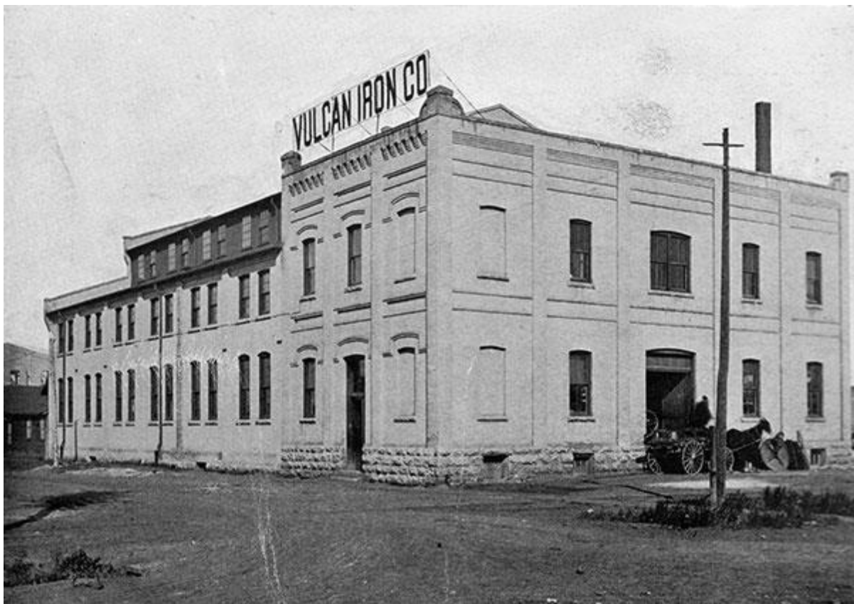
Figure C Vulcan Iron Works