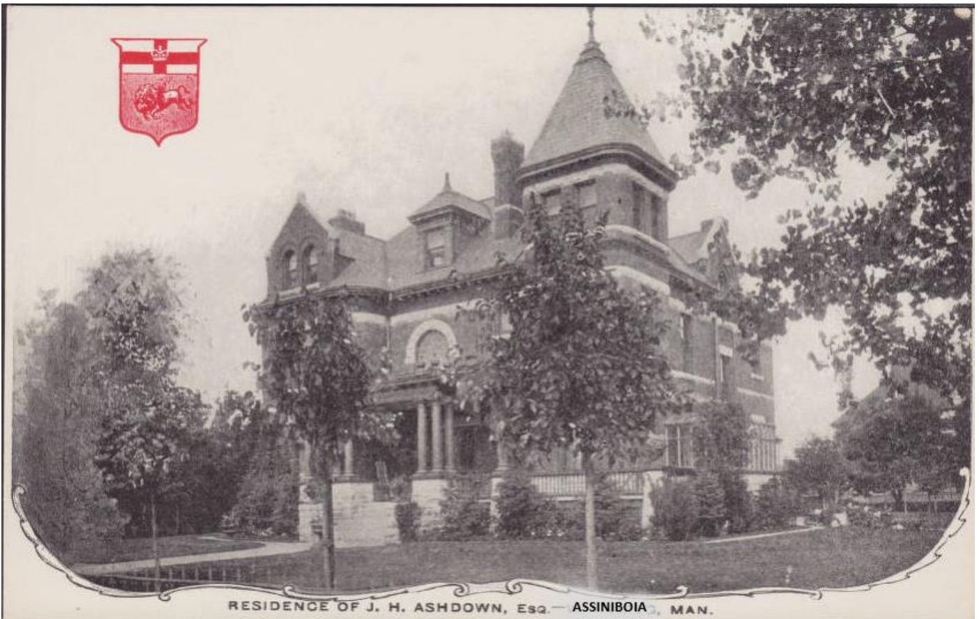
Figure E Ashdown House, 109 Euclid Avenue