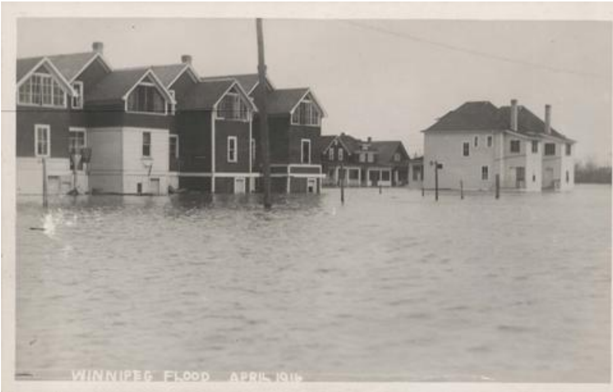
Figure D 1916 Red River Flood